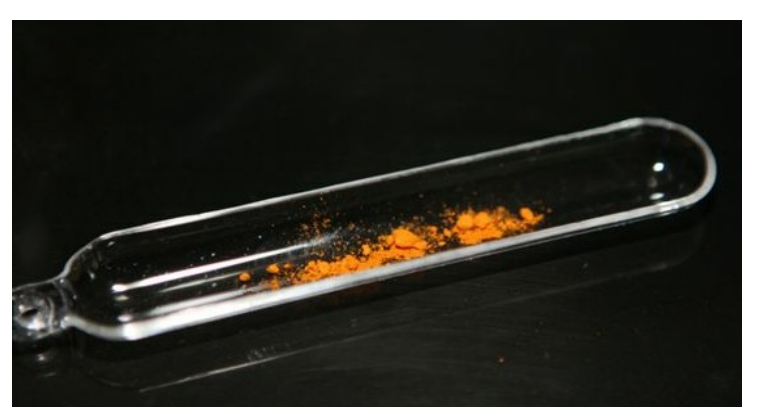
Appearance at visible light